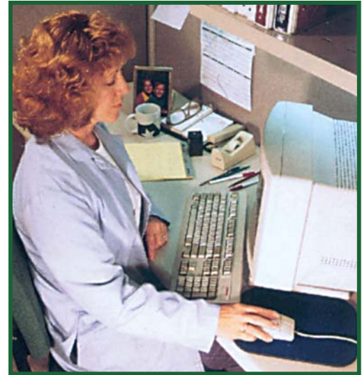
Access Watchdog from any networked computer.

Watchdog provides control and monitoring functions for room access, lighting, automated watering systems, and monitoring of room temperature, humidity, lights, airflow, and differential pressure.