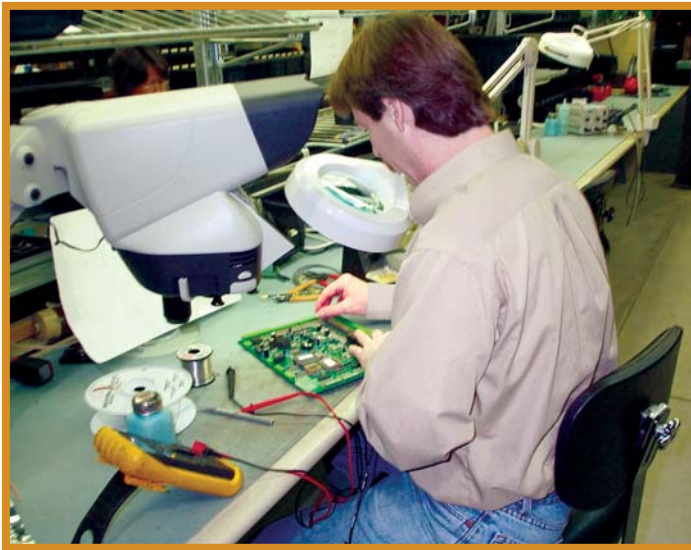
We test our designs for reliability and ease of operation.