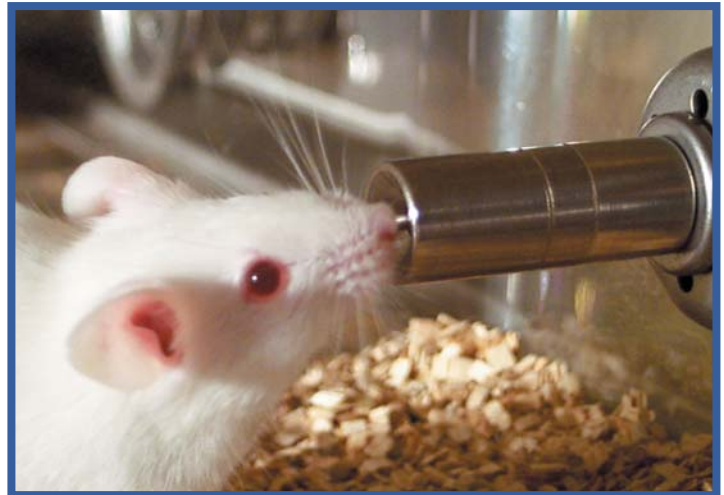
Mouse drinking from A160 shielded valve

These benefits are realized through practical design and over 30 years of experience. We complement these benefits by providing outstanding service before and after our systems are installed. Furthermore, we have the experience and drive to innovate to better serve our customers with new technologies and new ideas.